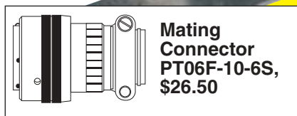
Mating Connector PT06F-10-6S, $26.50