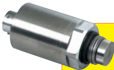
Model PX63Q1-500GV Shown Smaller Than Actual Size