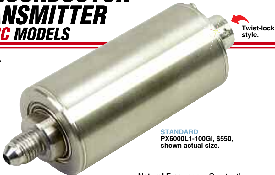
STANDARD PX6000L1-100GI, $550, shown actual size.

Vibration Sensitivity: At 20 g peak sinusoidal vibration from 10 to 2000 Hz ( \frac{1}{2} " D.A.), the output shall not exceed 0.04% FS/g for 15 psi range to 0.005% FS/g for 100 psi and above