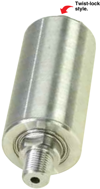
METRIC PXM6000MC1-010BARAI, $560, shown actual size.