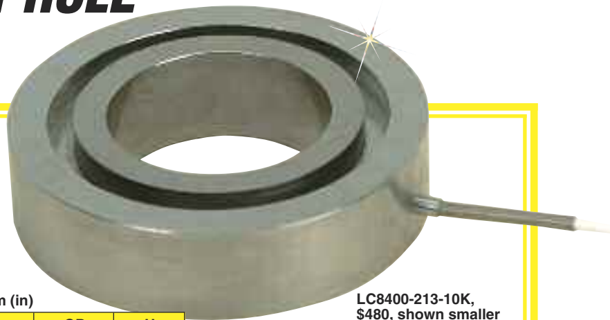
LC8400-213-10K, $480, shown smaller than actual size.

Electrical: 1.5 m (5') 4-conductor shielded cable