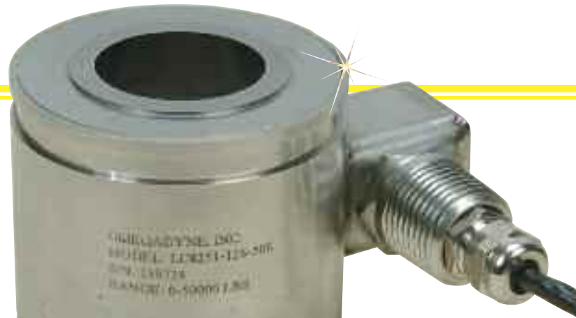
LC8251-126-50K, $690, shown actual size.

See Section Y for a Selection of Scientific, Technical, and Reference Books Available from omega.com