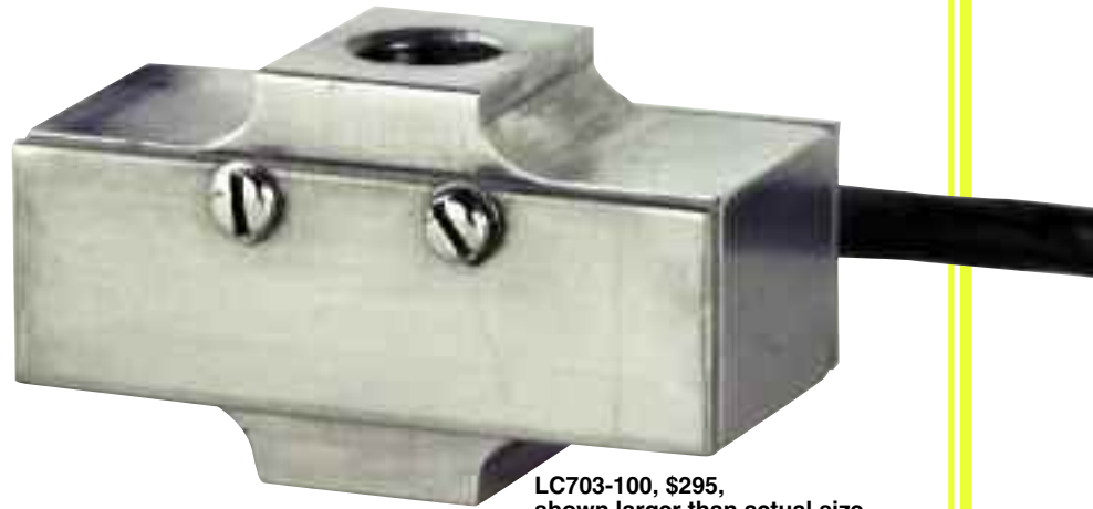
LC703-100, $295, shown larger than actual size.