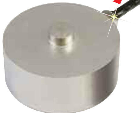
LCM305-2KN, $480, shown actual size.